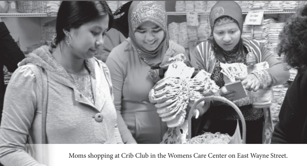
Moms shopping at Crib Club in the Womens Care Center on East Wayne Street.

The cost of having a baby can be overwhelming for new parents. The good news is there are resources in the community who have free supplies for your infant. Everything from formula, diapers, and clothing to free parenting and CPR training classes. Several of the agencies listed here have “earn while you learn” systems that give participants free coupons for supplies after attending parenting classes or receiving pregnancy wellness checkups.