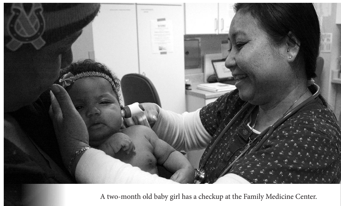
A two-month old baby girl has a checkup at the Family Medicine Center.