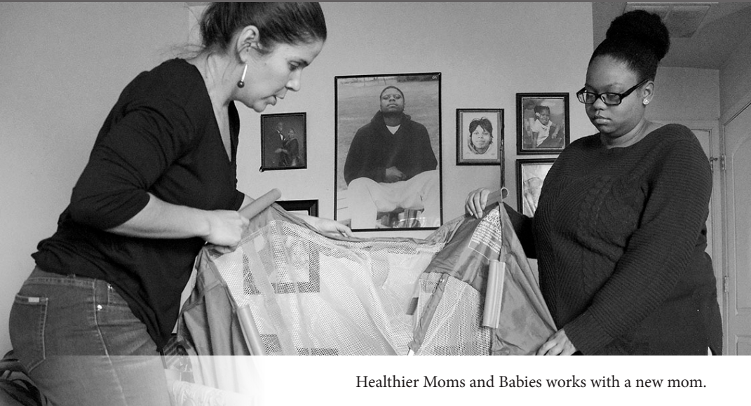
Healthier Moms and Babies works with a new mom.

Expecting mothers, new parents, and family members have many questions and need support for a successful outcome to their pregnancy and the first year of life.