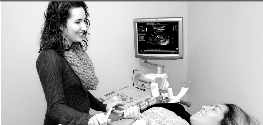
The Women's Care Center provides free ultrasounds and much more.

Several local agencies provide free and confidential counseling, support, education, medical assistance, and referrals to women and men facing pregnancies, planned and unplanned. These are great resources for new families seeking free and low-cost but high-quality care and assistance in preparing for the pregnancy and birth of a child.