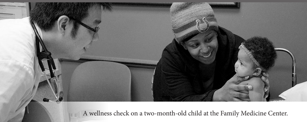
A wellness check on a two-month-old child at the Family Medicine Center.

Being healthy before, during, and after your pregnancy is vital to the birth of a healthy newborn and your health after delivery. Selecting a provider and attending all your appointments is crucial to you and your baby.