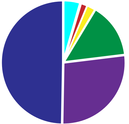
expenses by program